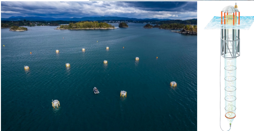
601 Figure 1. Pelagic mesocosm facilities currently used in OAE research. top left : Land-based mesocosms (1 m 3) 602 at the University of Vigo, Spain. top right : In situ on-shore mesocosms (10 m 3) operated by GEOMAR, here 603 employed on Gran Canaria, Spain. bottom left : Kiel Off-Shore Mesocosms for Ocean Simulations (KOSMOS), 604 here employed in the Raunefjord, Norway. bottom right : Sketch of a KOSMOS mesocosm unit (55 m 3). 605