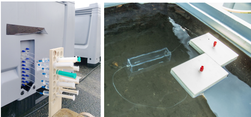
Figure 5: Left : Distribution device used for alkalinity addition; by moving it up and down in the water column during alkalinity injection at constant speed a uniform alkalinity enhancement can be achieved. Right : Milky water at the outlet of the injection tubes indicates temporary precipitation which, however, quickly disappears as the highly concentrated alkalinity solution dilutes.

641 642 643 644 645 646 647 648 649 650 651